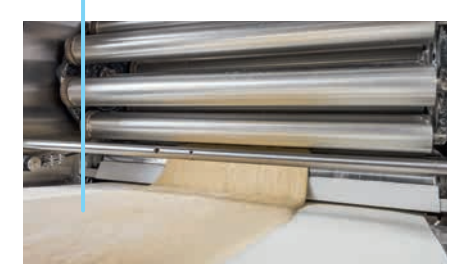
2 Stress-free dough band