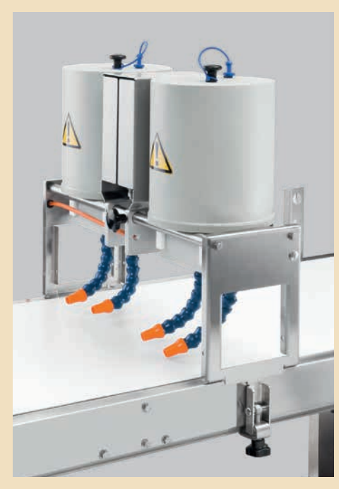
Mechanical filling device For creamy to semi-viscous, self-flowing fillings, the Polyline can also be equipped with a mechanical filling device.